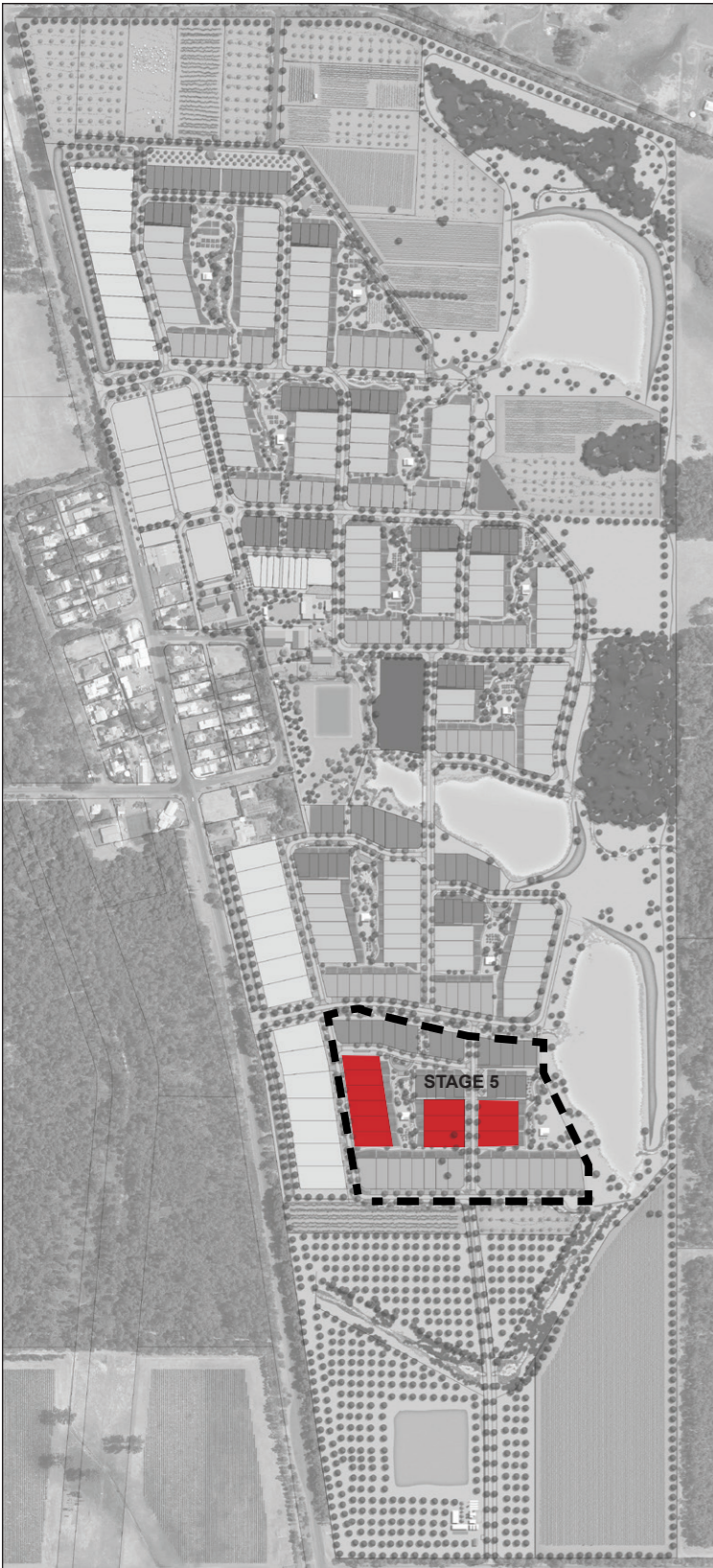
Location Plan - Family Lots (Stage 5)