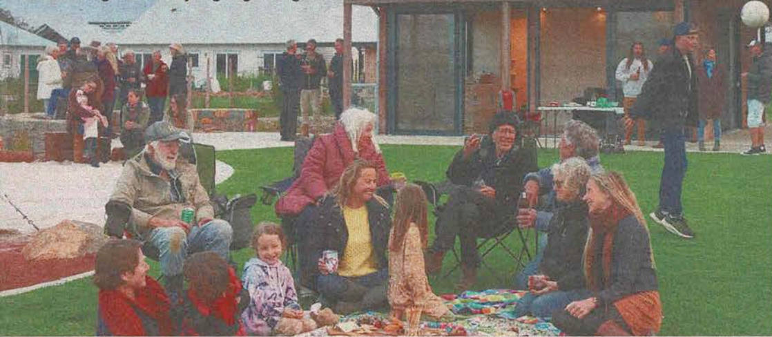
Witchcliffe Ecovillage residents of Cluster 1A gather in their community garden at their regular Friday night get-together.