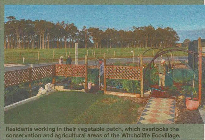
Residents working in their vegetable patch, which overlooks the conservation and agricultural areas of the Witchcliffe Ecovillage.